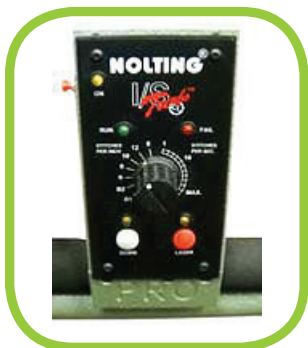
IS TURBO CL Stitch Regulator