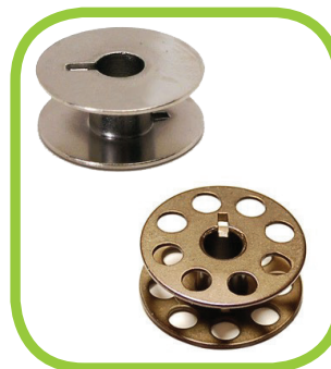
"L or M" bobbin