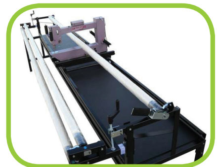
Nolting Commercial Steel Frame