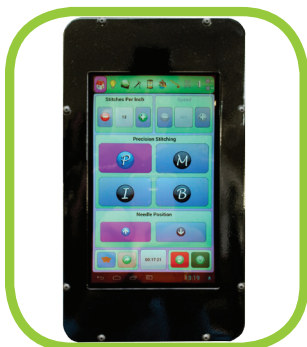
New NV Touch Screen Stitch Regulator

The NV is our fifth generation stitch regulator. The features and tools that make up the NV are designed to make your quilting easier, more accurate and more productive.