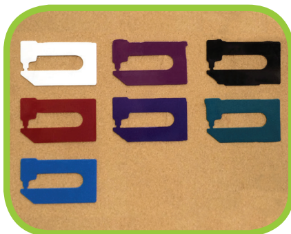
High Gloss Custom Paint Colors

Professional packages include machine, frame, needles, bobbins, bobbin winder, oil, patterns, clamps, leaders, product manuals, and 5-year warranty. Additionally, Nolting offers exceptional services such as delivery, package installations, and superior professional training.