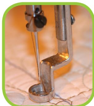
Round Foot For Ruler Guides