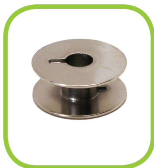
Popular "L" bobbin